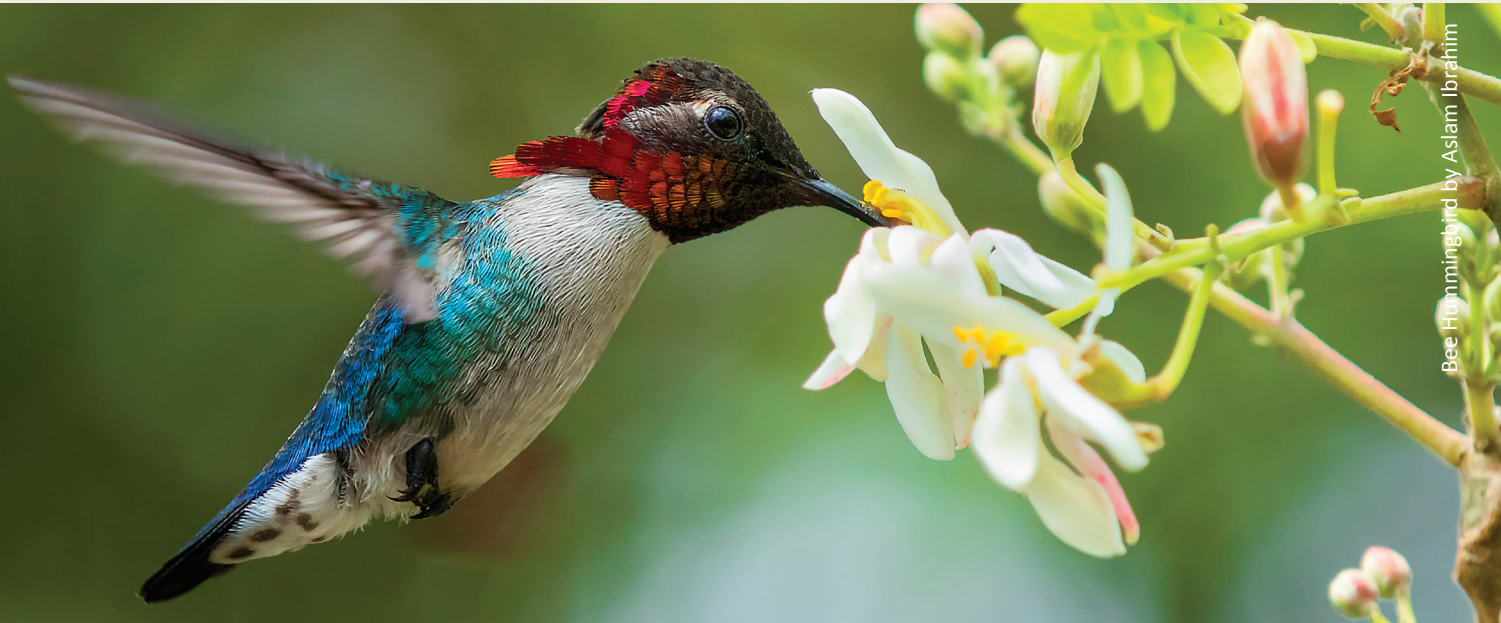
Bee Hummingbird by Aslam Ibrahim

The Caribbean Birding Trail is a network of the best sites on each island for birdwatching , enjoying nature and experiencing culture .