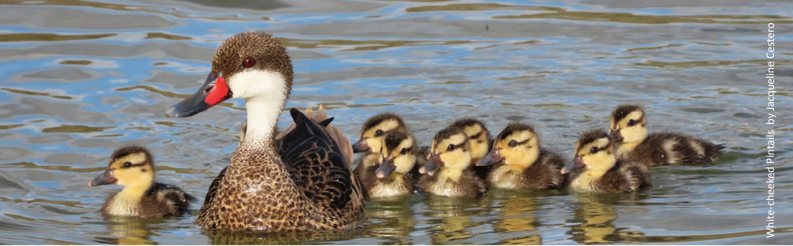
White-cheeked Pintails by Jacqueline Cestero

The goal of the Caribbean Birding Trail is to work with conservation organizations, protected area managers, government agencies, tourism boards, tour operators, and guides throughout the region to develop sustainable tourism opportunities around birdwatching and nature.