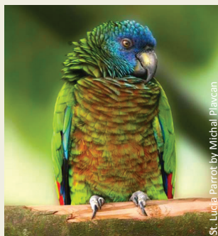
St. Lucia Parrot by Michal Plawcan