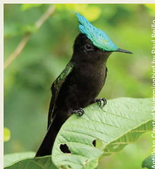
Antillean Crested Hummingbird