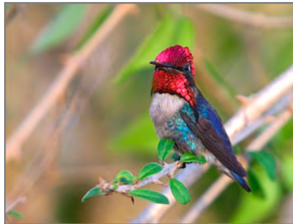
Bee Hummingbird, Cuba's most adorable bird and smallest bird in the world.

Days 10 & 11 (Havana): Two full days in Havana with diverse cultural activities including a walking tour of Old Havana, old fashioned car ride, visits to art galleries and museums, historical buildings and monuments, central park, walk on Malecón, shooting of canon at Cabaña Fort, street markets, etc. We will also visit with Orlando Garrido , greatly respected retired naturalist and author of the Field Guide to the Birds of Cuba to see his private ornithological collection and chat about the history of Cuban ornithology of which Orlando is a colorful and prominent figure. Final dinner at a nice restaurant and live Cuban music and dancing into the evening (optional).