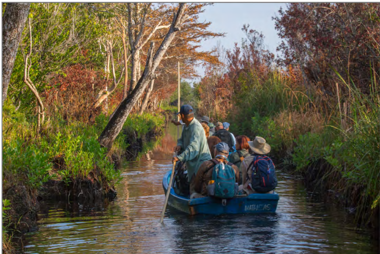
Boat ride in search of the Zapata Sparrow and Zapata Wren Santo Tomas, Zapata Swamp