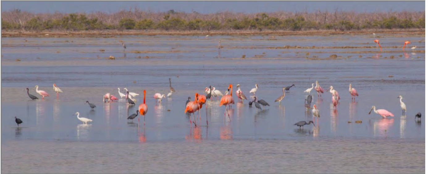
Waterbirds feeding at Las Salinas, Zapata Swamp