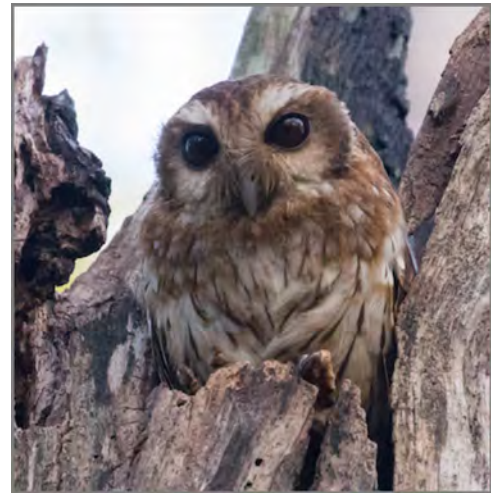
Bare-legged Owl in Bermejas, Zapata Swamp

Once you have registered to go on the trip you will receive more information, including what to bring, what to wear, bird checklist, and travel in Cuba, which is an inimitable experience and part of the fun!