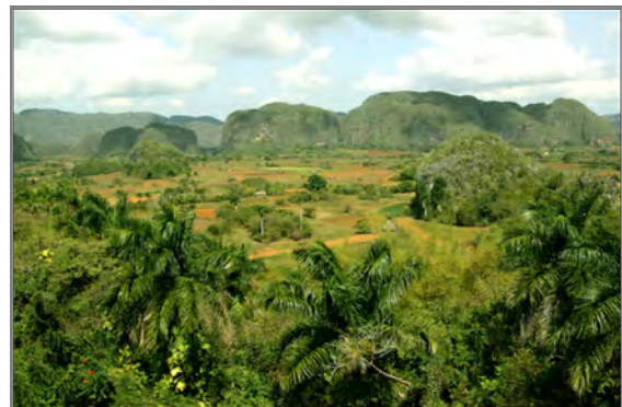
Viñales Valley with mogotes by Carrol Henderson

Day 4 (Zapata: La Cuchilla, Caminos los Jarros, Bermejas, Cueva de los Peces, and Los Hondones): Early breakfast and departure for Bermejas (45 minutes) for birding in mixed forest habitat (flat, easy-walking trail system 2+ miles). Excellent chance for Bee Hummingbird, Gray-fronted Quail-Dove, Key West Quail-Dove, Ruddy Quail-Dove, Cuban Parrot, Cuban Blackbird, Cuban Bullfinch, Loggerhead Kingbird, Bare-legged Owl and Cuban Pygmy Owl . The threatened Cuban Parakeet, Fernandina's Flicker , and Blue-headed Quail-Dove are also likely.