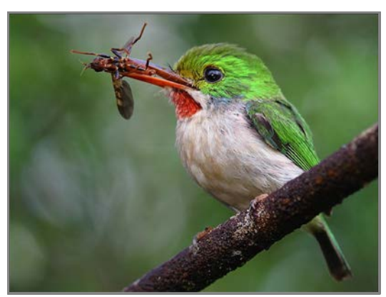
Cuban Tody by Ernesto Reyes

Cuba is well-known for its amazing landscapes, vibrant culture and unique biodiversity. According to the new Endemic Birds of Cuba: A Comprehensive Field Guide , 371 birds have been recorded in Cuba, including 27 which are endemic to the island and 30 which are considered globally threatened. Due to its large land area and geographical position within the Caribbean, Cuba is also extraordinarily important for Neotropical migratory birds—more than 180 species pass through during migration or spend the winter on the island.