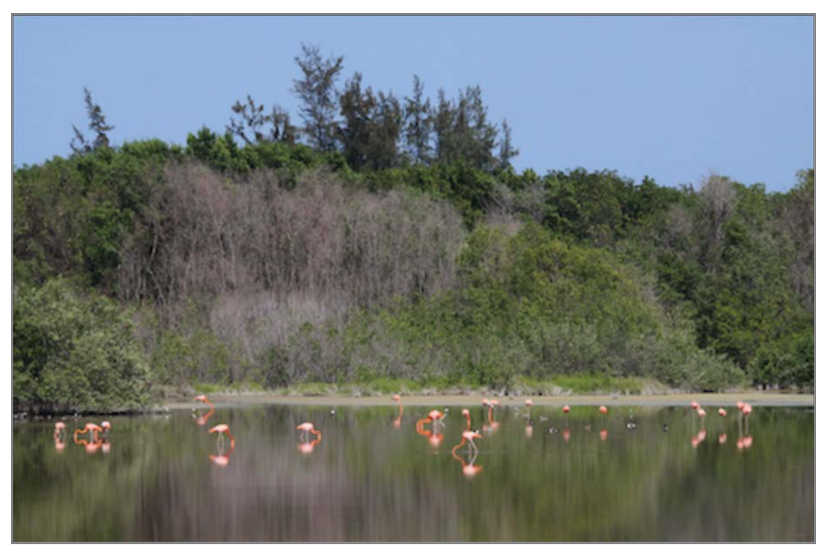
Flamingo Lagoon at Cayo Coco by Carrol Henderson

http://www.birdscaribbean.org/2015/11/birding-tours-of-cuba-in-2016-from-birdscaribbean