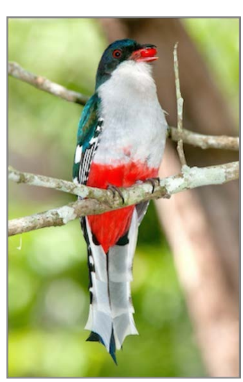
Cuban Trogon