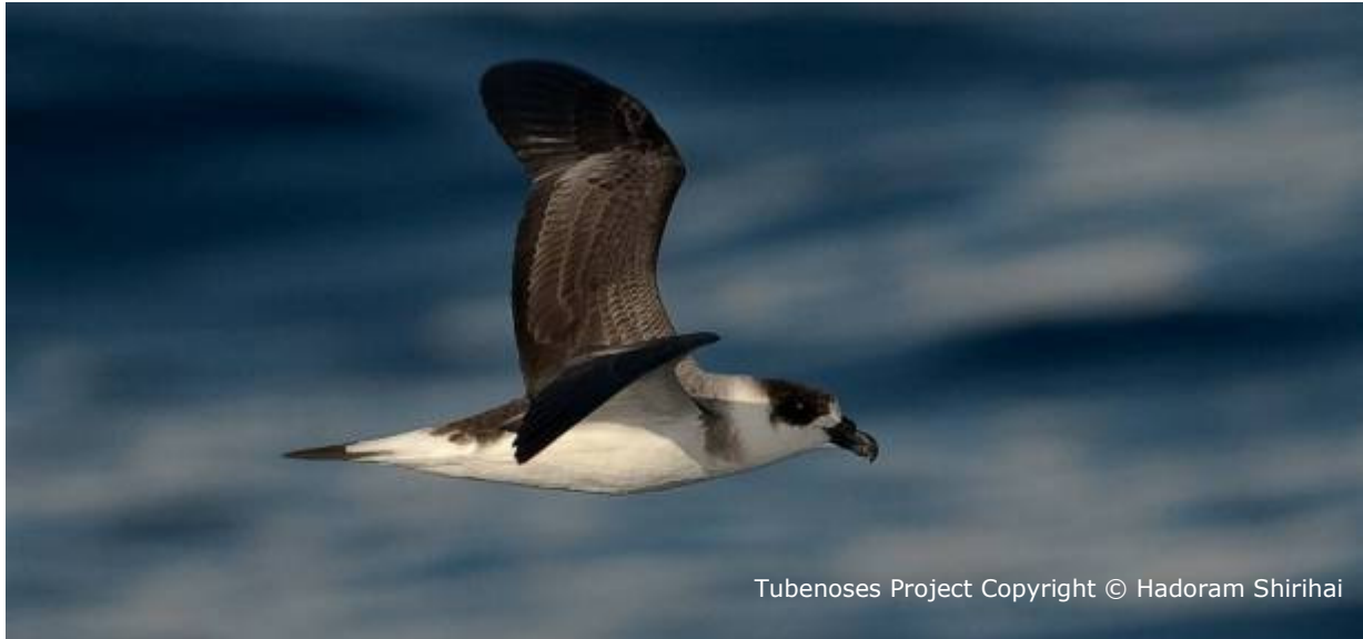
Black-capped Petrel attracted to chum in Jamaican waters