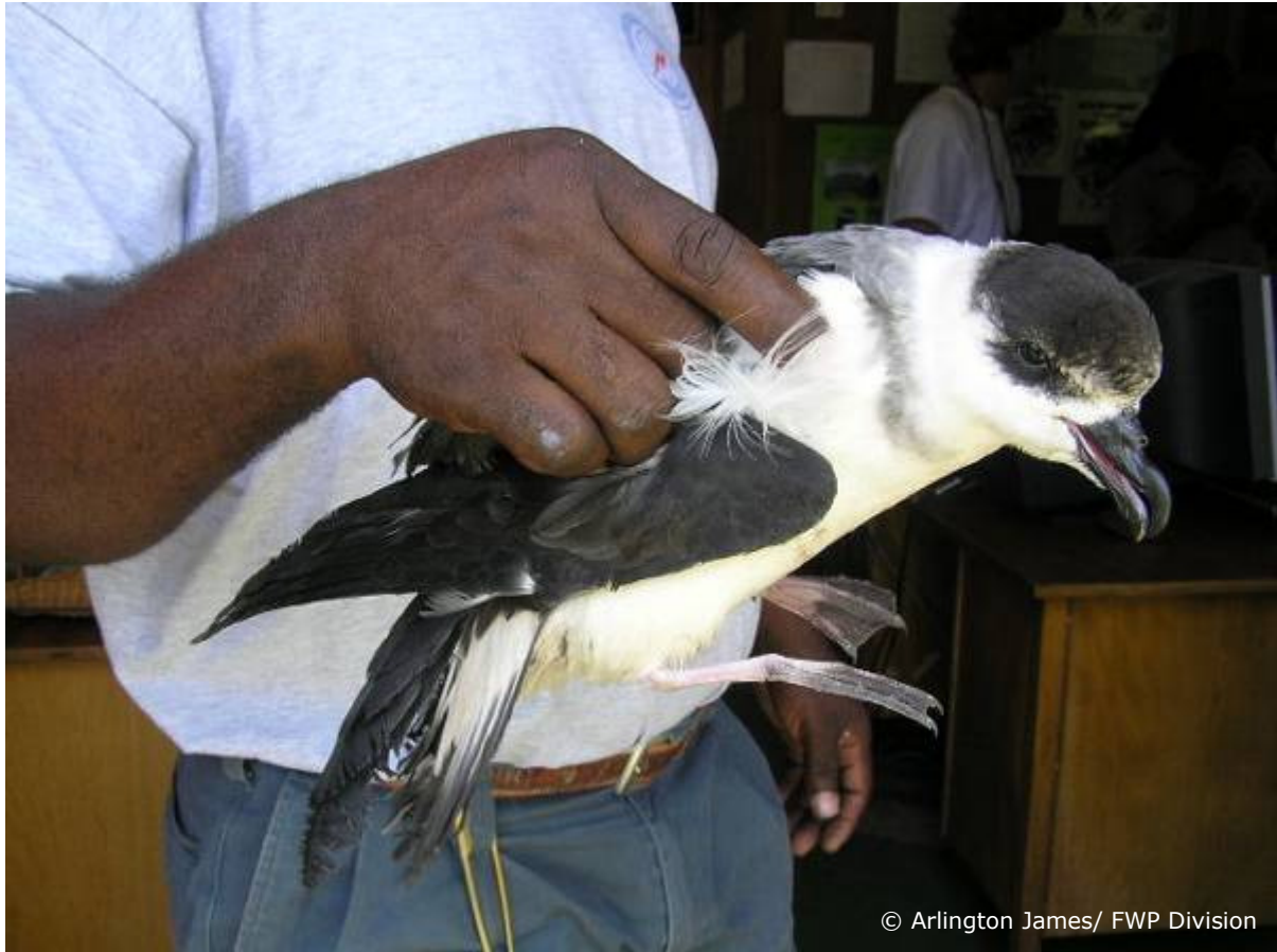
Black-capped Petrel found at Trafalgar in May 2007

The valley between Morne Anglais and Morne Trois Pitons looks perfect for breeding petrels, and Trafalgar could be a 'trap' for disoriented young petrels. Given this, I suggested to Arlington that he should encourage the villagers to contact him with any future information about petrels there, and I recommended some 'first aid' tips, to increase the possibilities of successfully releasing such birds. The visit to Dominica was useful in confirming that there is much habitat left on the island for breeding petrels (and unlike Guadeloupe there is no introduced mongoose).