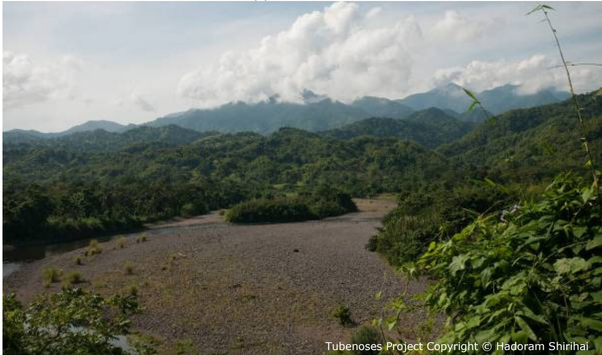
North slope of the Blue and John Crow Mountains – possible nesting area for Black-capped Petrels

found alive, a bird that looked like 'Black-capped Petrel' in the John Crow Mountains. He had given the bird to her and her mother. From the field guide she immediately and confidently identified the bird from its size and plumage in my photographs. Her family were formerly hunters and her brother collected the bird on the ground. Her description was accurate in many ways for Black-capped Petrel, including its 'strange webbed' feet. She also knows many of the local birds' names, so I feel confident that she indeed has seen a Black-capped Petrel from the John Crow Mountains.