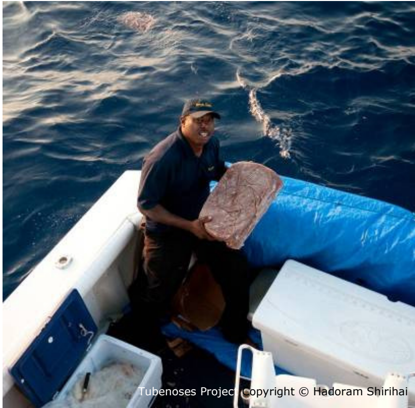
Tubenoses Project