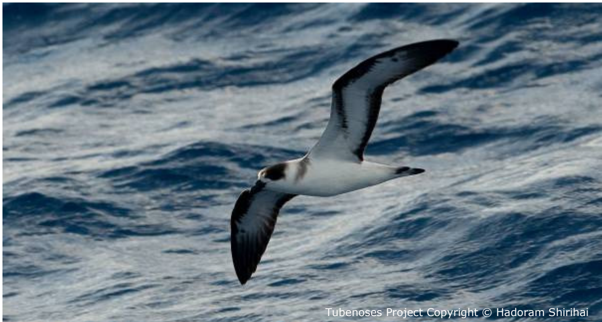
Black-capped Petrel – all birds seen were of the small, dark-faced form

Still no evidence of Jamaica Petrel, but again we had a more favourable wind for petrels, up to 18 knots, with larger waves and good cloud cover. Thus, we headed to the 'hotspot' 13–16 offshore, at 18°16'14.46"N, 76°10'56.86"W (c.17 north-east of Port Antonio), and this produced the largest numbers of Black-capped Petrels to date. The current was moving SE–NW and the wind in the opposite direction (north-east), but we drifted north-west with the current, ending at 18°21'28.15"N, 76°14'59.18"W. Black-capped Petrels reached this area during the last two hours (15.53–17.44 h, ten birds of the total of 12): most investigated the chum briefly, before heading towards the island. Most did not attempt to take any food, just checked the chum and then continued. All were 'dark-faced' and smallish to medium-sized. Photographs were obtained of several birds.