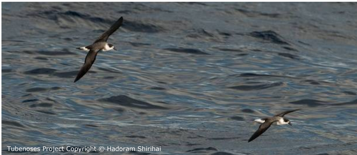
Black-capped Petrels (male left, female right) observed in display behaviour in Jamaican waters

Off Jamaica, we did not find Jamaican Petrel. Nevertheless, we observed a total of 46 individuals of the Endangered Black-capped Petrel. At this stage, it is impossible to be sure that these are Jamaican breeders, but their behaviour suggests they are and that the principal nesting area lies in the John Crow Mountains. They were observed coming close to the island during the late afternoon / evening, in small numbers, sometimes pairs (in one case a male and female were observed displaying). Furthermore, they nearly always seemed to head toward the island or to 'hang around' at sea below the mountains, as if waiting for darkness before flying inland.