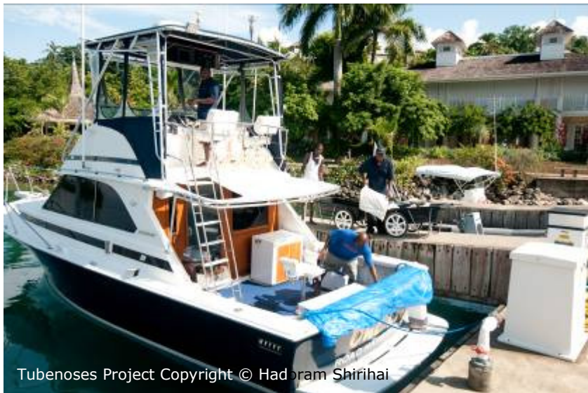
Tubenoses Project

We used the fast, US-owned but Jamaica-based deep-ocean boat: the One Love is 16 m long and can accommodate four observers and crew on