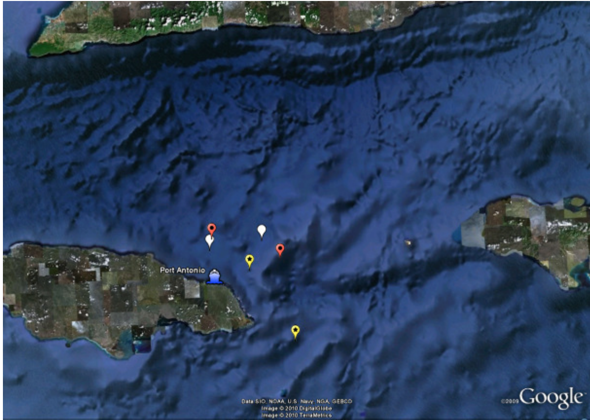
“Chumming” locations used during this expedition. White flags – no petrels; red flags - 1-2 petrels; yellow flags – up to 12 petrels recorded

During the expedition, we spent a total of 98.15 hours at sea (over the 10 days), of which c.50 hours were spent travelling between positions (but with continuous observations), and 43.25 hours of chumming at given positions.