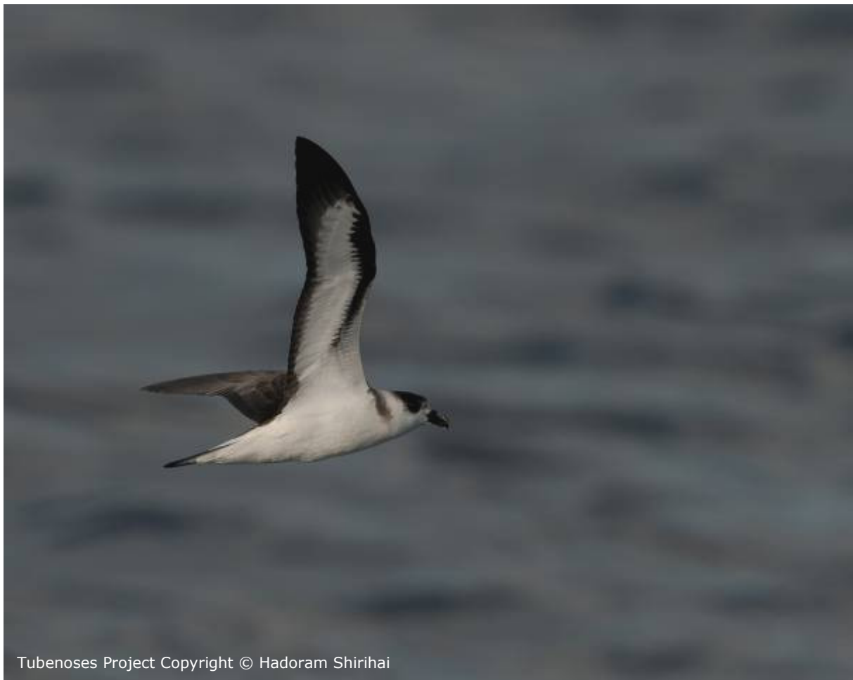
Black-capped Petrel – showing bold underwing pattern with solid back wing-tips, rather extended/solid dark-faced pattern and with short chunky bill, and small overall size (see also main text).