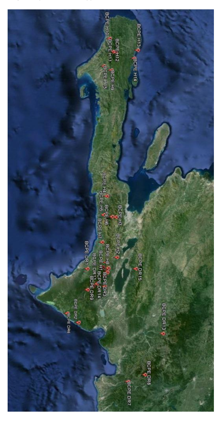
Map 1: Hispaniola Black-capped Petrel Radar Stations