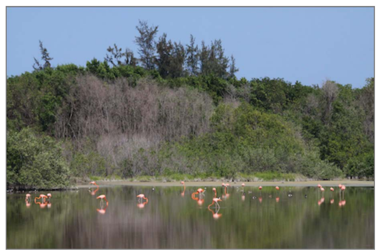
Flamingo Lagoon at Cayo Coco

http://www.birdscaribbean.org/2015/11/birding-tours-of-cuba-in-2016-from-birdscaribbean