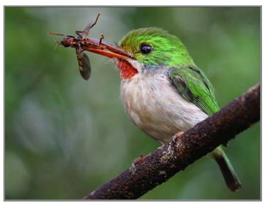
Cuban Tody by Ernesto Reyes

Cuba is well-known for its amazing landscapes, vibrant culture and unique biodiversity. According to the new Endemic Birds of Cuba: A Comprehensive Field Guide , 371 birds have been recorded in Cuba, including 27 which are endemic to the island and 30 which are considered globally threatened. Due to its large land area and geographical position within the Caribbean, Cuba is also extraordinarily important for Neotropical migratory birds—more than 180 species pass through during migration or spend the winter on the island.