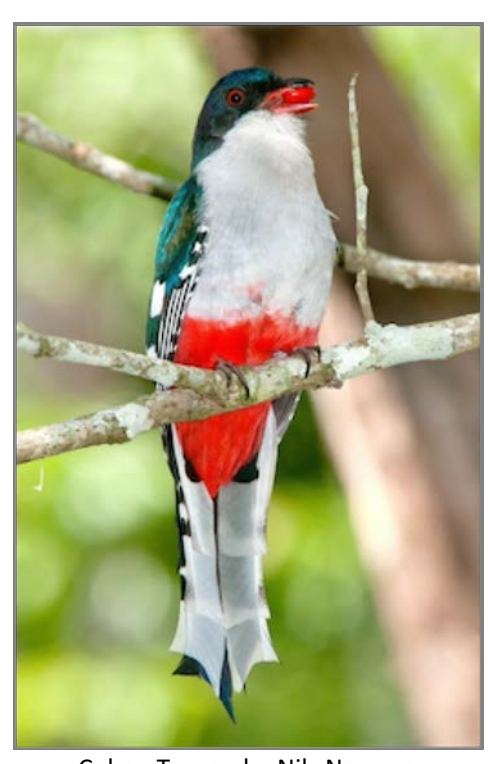
Cuban Trogon